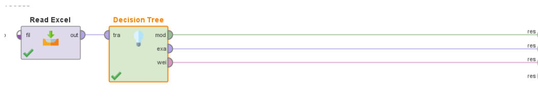
Figure 1. Decision tree relationship